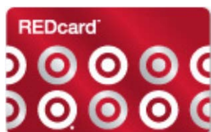
Target debit & credit cards